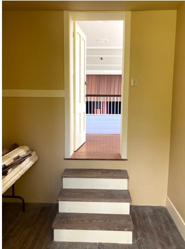
1. Looking East. July 4, 2022.

COMPLETION: Tower Level 2 (“Yellow Room”)