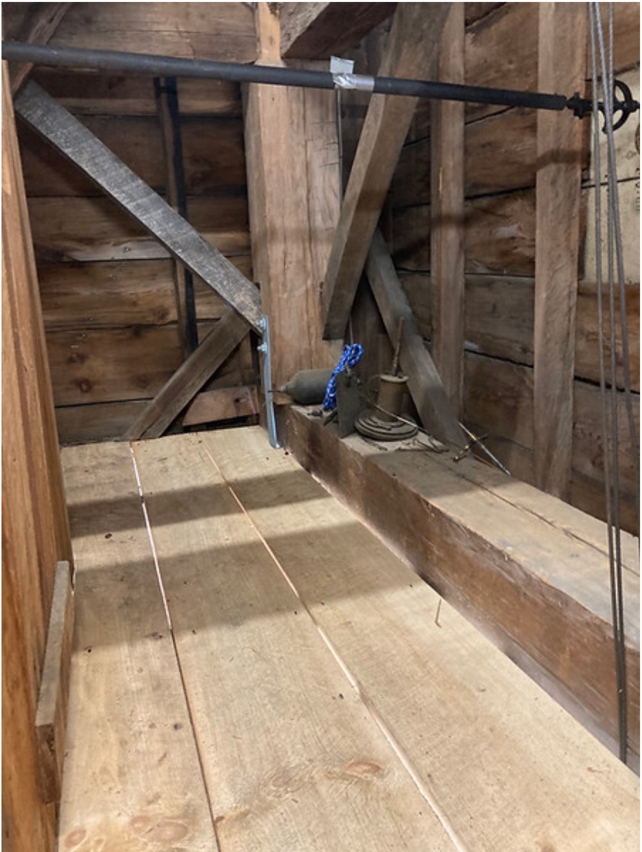
3. Looking south. Clock enclosure on left. September 24, 2022.