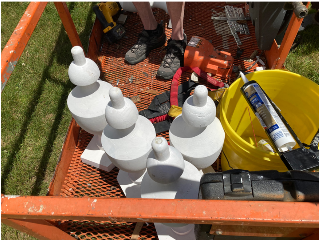
12. New urns to be installed at Bell Level 3. June 14, 2022.