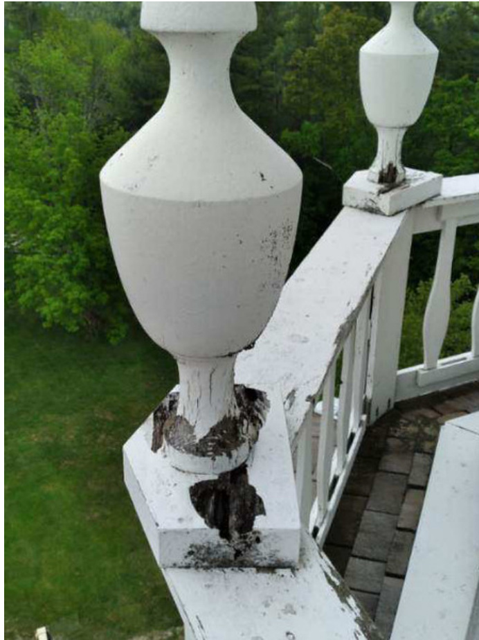
9. Deteriorated urns on Bell Level 3. May 27, 2022.