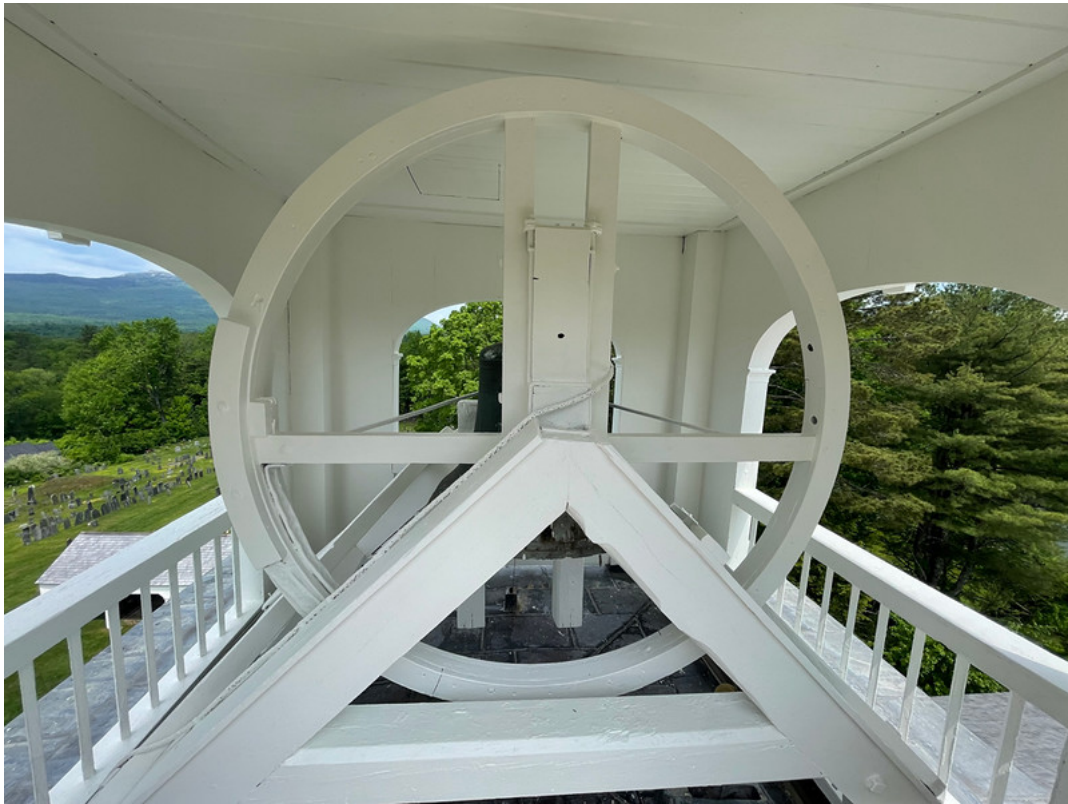
15. Bell Level 1. Looking north. Bell apparatus. June 2, 2022.