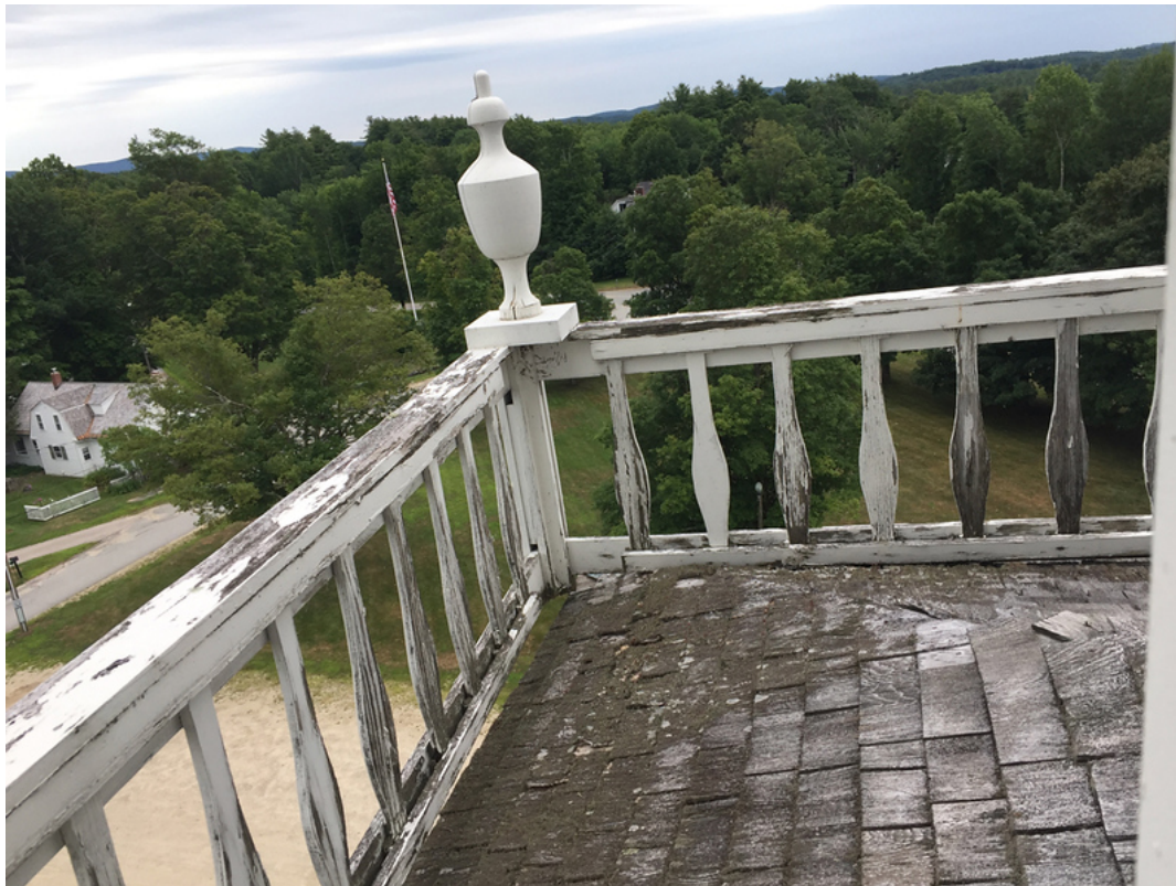
8. Southwest corner of Bell Level 2 showing deteriorated balustrade and roof. August 7, 2020.