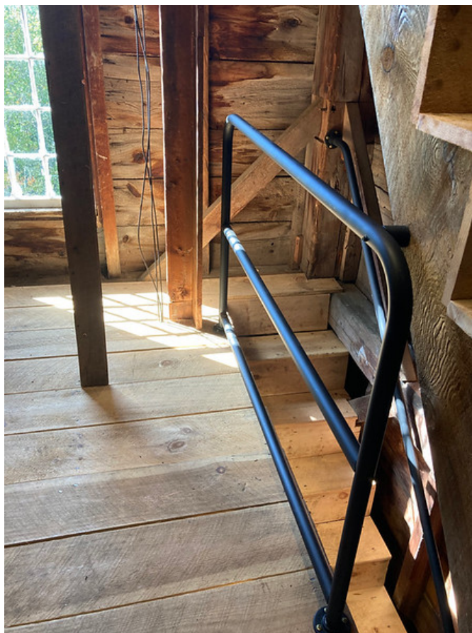
2. Looking west. Stairs down to Level 3. September 24, 2022.