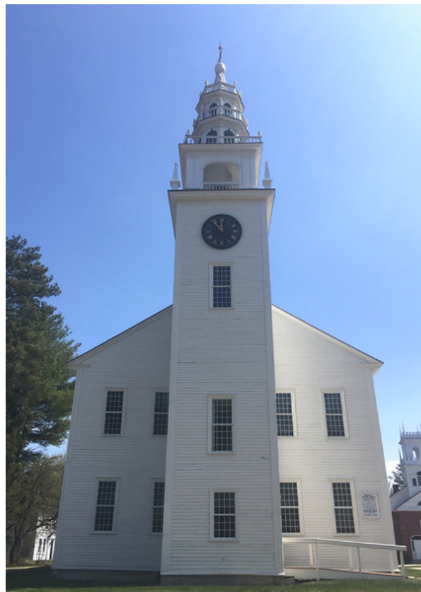
2. View of the Tower looking east prior to any work being done. May 3, 2020.