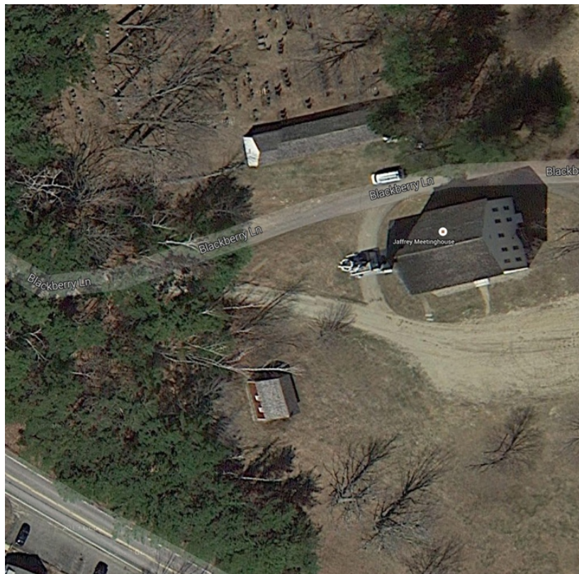
4. Aerial view showing Route 124 (at bottom), Little Red Schoolhouse, Old Burying Ground, Horsesheds, and Meetinghouse.