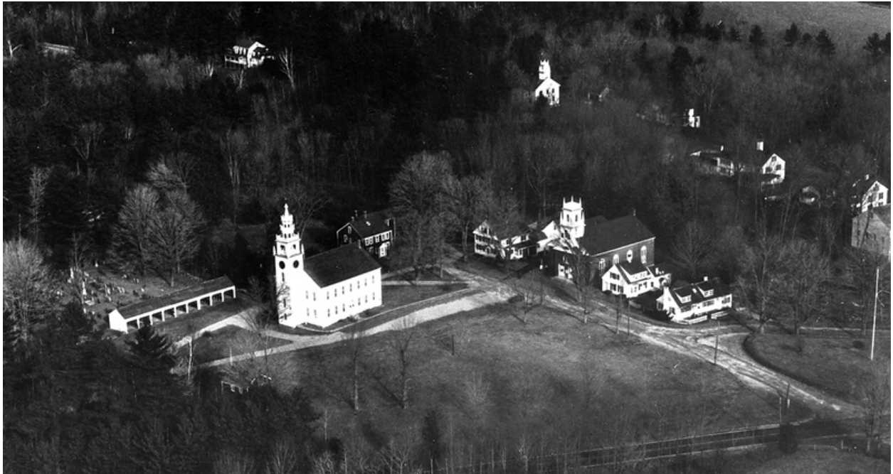
5. Aerial view looking northeast, with the Meetinghouse, Horsesheds, Old Burying Ground, Little Red Schoolhouse, Cutter Tavern, First Church, Thorndike Store, The Common, Cutter Park and Melville Academy comprising the ensemble—the original heart of Jaffrey. (1980)