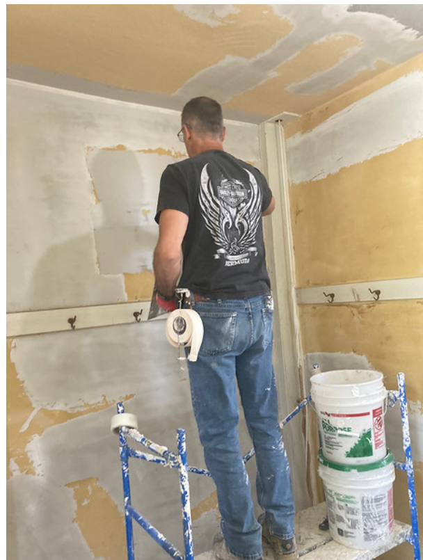
6. Looking Northeast. June 7, 2022.