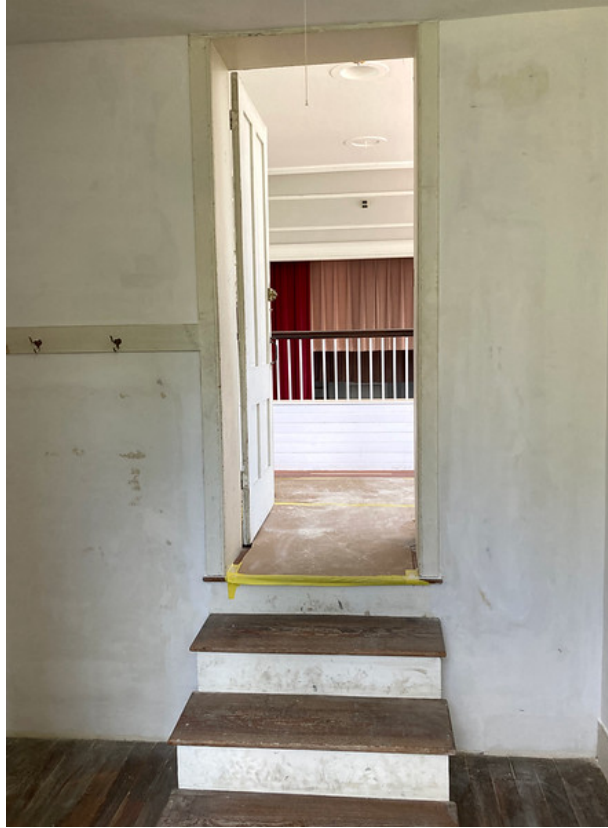
5. Looking East. June 14, 2022.