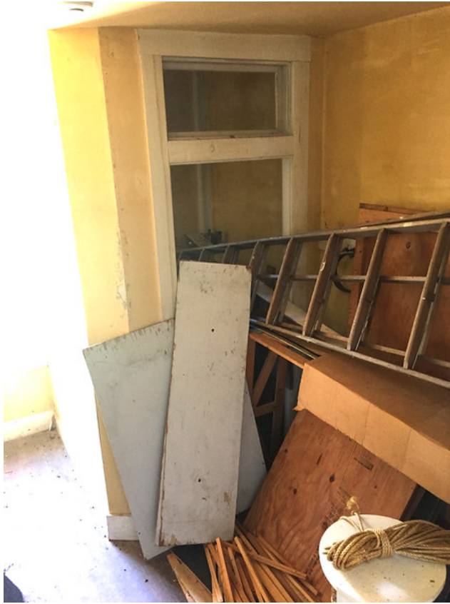
3. Looking northwest. Former toilet cubicle at rear. June 12, 2020.