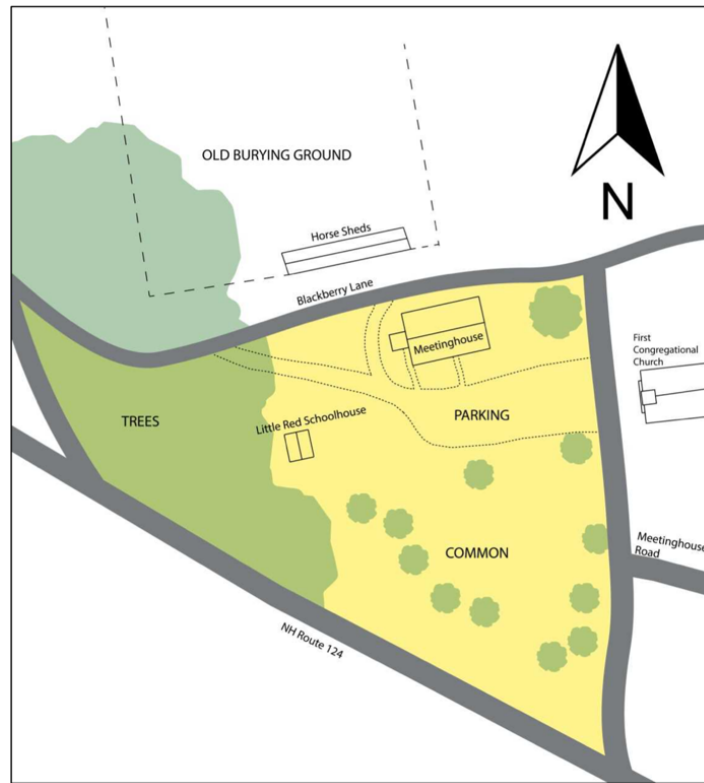
3. Diagrammatic plan of the Meetinghouse surroundings.