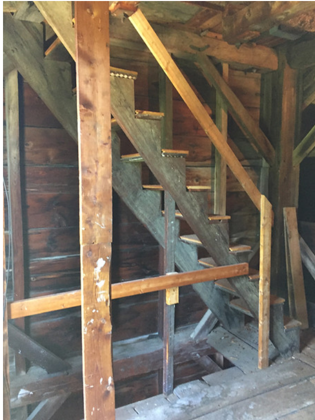
1. Tower Level 4 looking northeast with stairs up to Level 5. June 12, 2020.