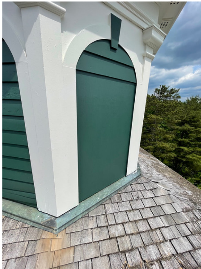
16. Bell Level. Looking north. Green panels. June 2, 2022.