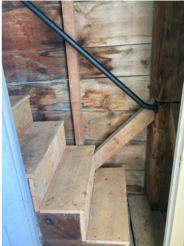
1. Looking south. Stairs up to Level 3. September 24, 2022.