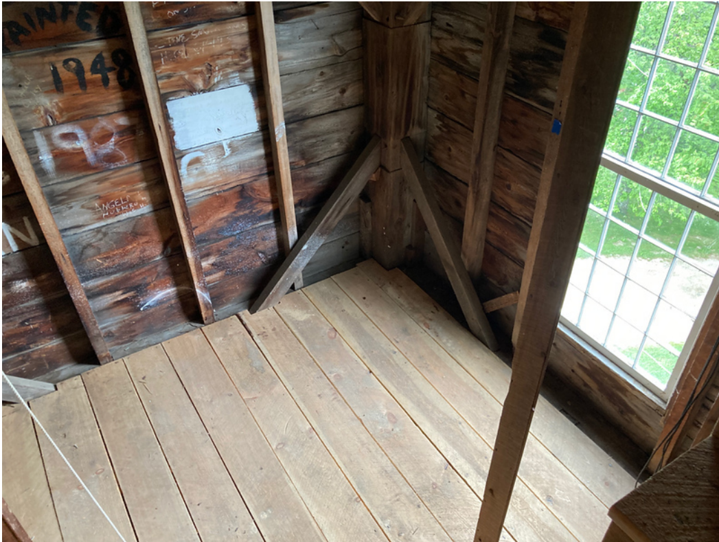
1. Looking southwest. May 28, 2022.