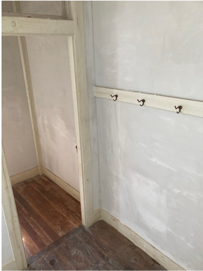
7. Looking northwest. Former toilet cubicle at rear. June 8, 2022.