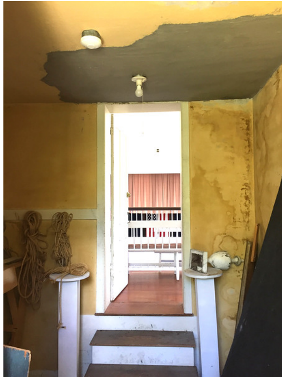
1. Looking East. June 12, 2020.