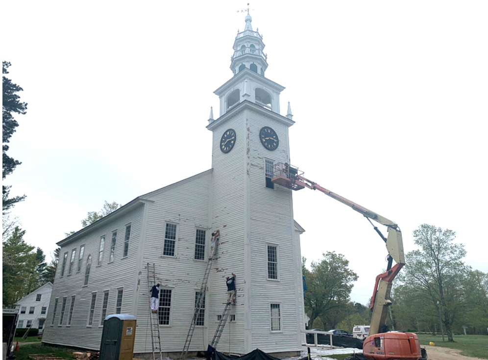
10. Preparing for painting, west façade and tower looking southeast. May 13, 2022.