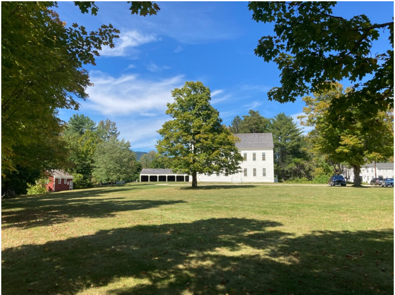
6. Looking north across the Common. Little Red Schoolhouse on the left, Horsesheds with Old Burying Ground beyond, Meetinghouse, former Cutter Tavern on the right. September 16, 2022.