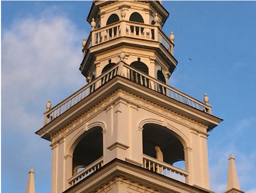
7. View looking northeast showing deteriorated balustrade on the roof of the Bell Level 1. July 15, 2020.