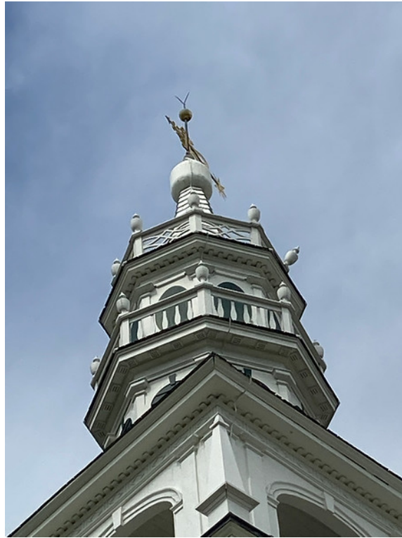
13. Bell Levels. Note tipping urn on upper right. May 26, 2022.