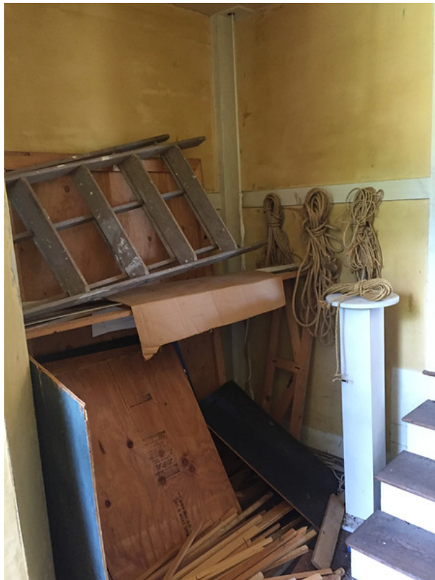
2. Looking Northeast. June 12, 2020.