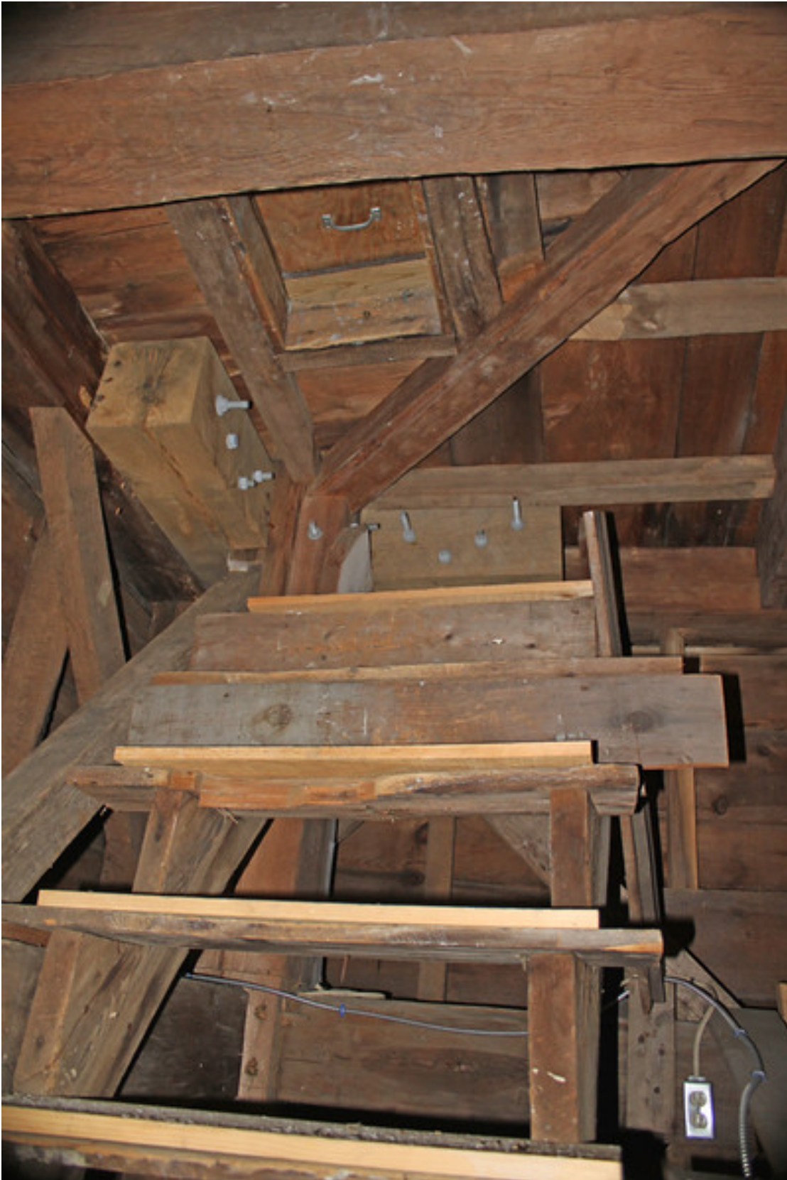
1. Tower Level 5 with stairs to Bell Level 1. June 2, 2016.