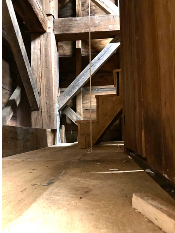
1. Looking south. Stairs to Bell Level 1. Clock enclosure on right. September 24, 2022.