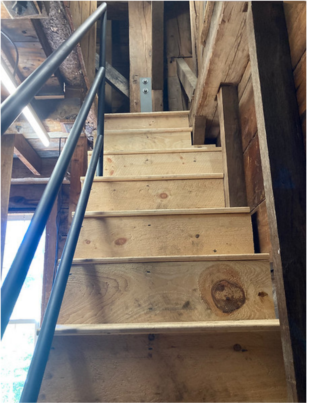
3. Looking west. Stairs up to Level 4. September 24, 2022.