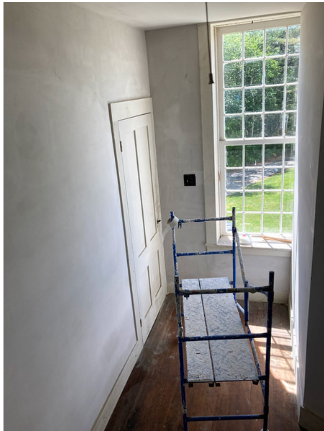
8. Looking west. Door to upper Tower on left. June 8, 2022.