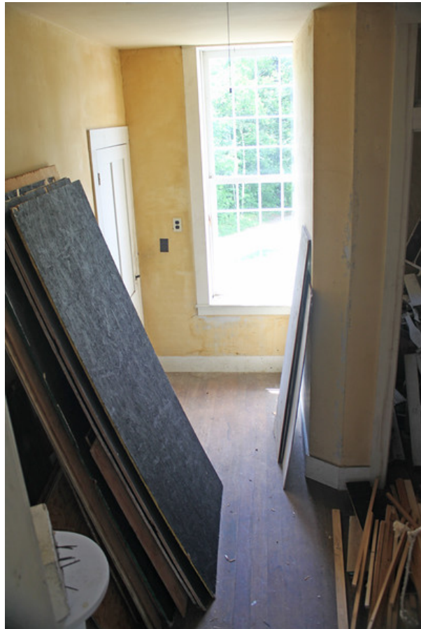
4. Looking west. Door to upper Tower on left. June 12, 2020.