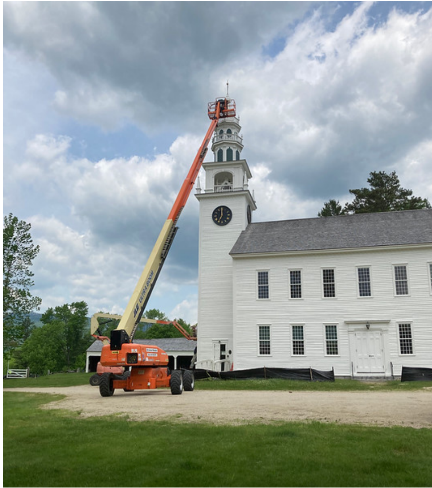
11. Painting, south side of Tower, looking north. May 31, 2022.