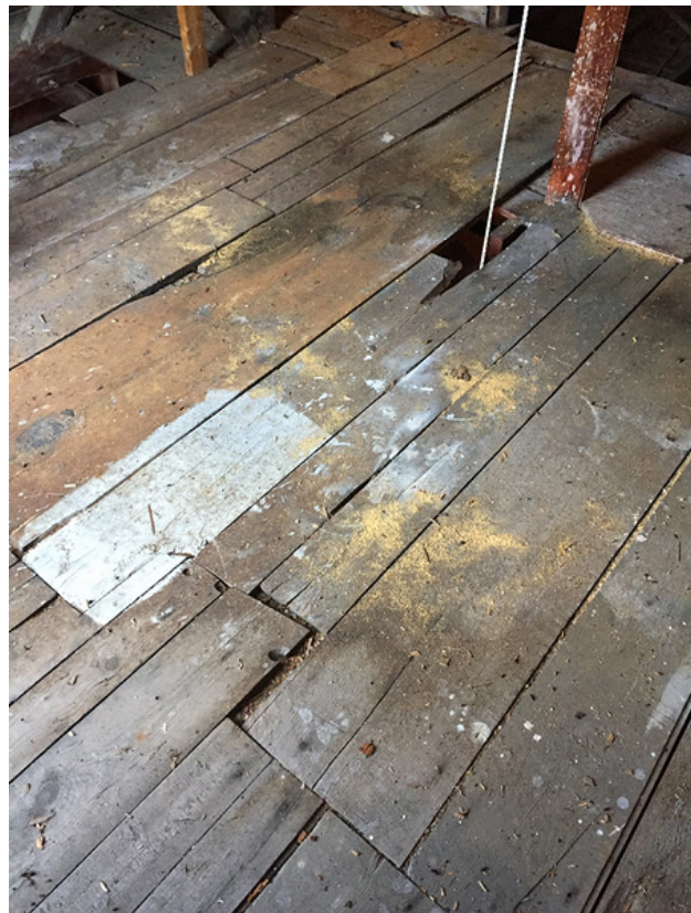
2. Tower Level 4 flooring looking northeast. June 12, 2020.