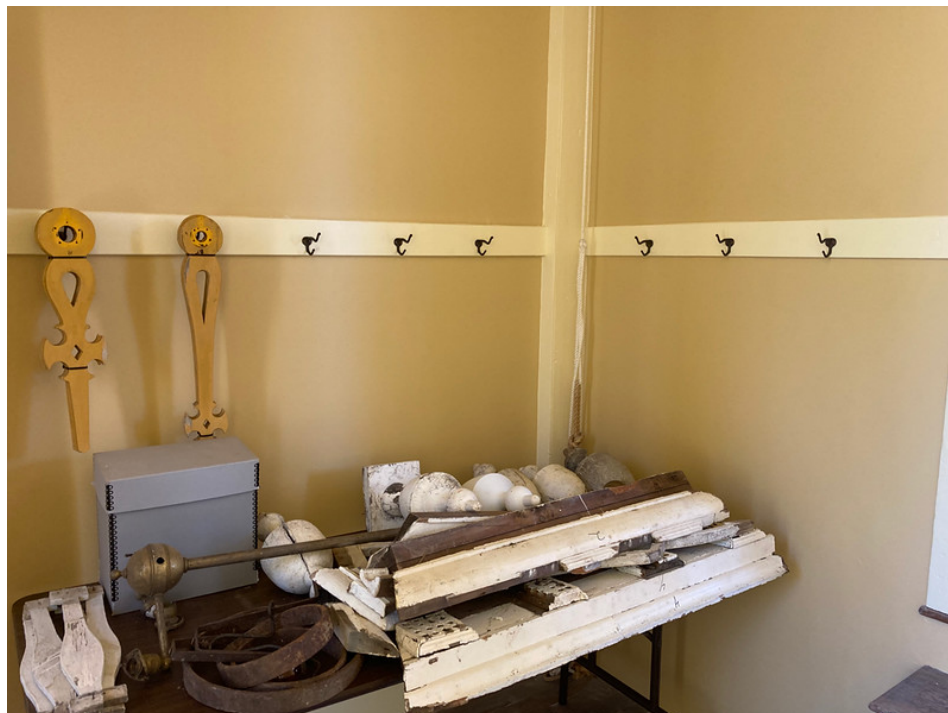
2. Looking Northeast. September 24, 2022.