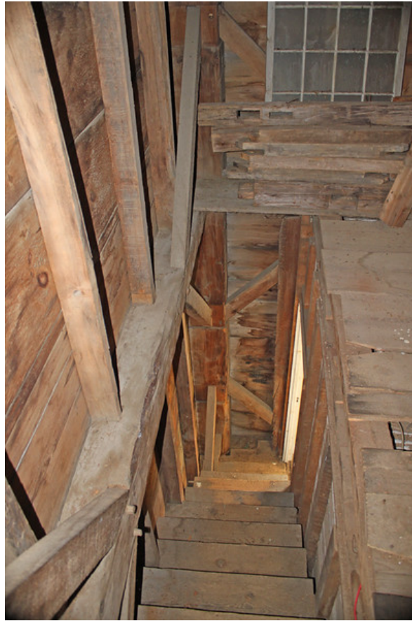
1. Looking down stairs from Tower Level 3. June 2, 2016.