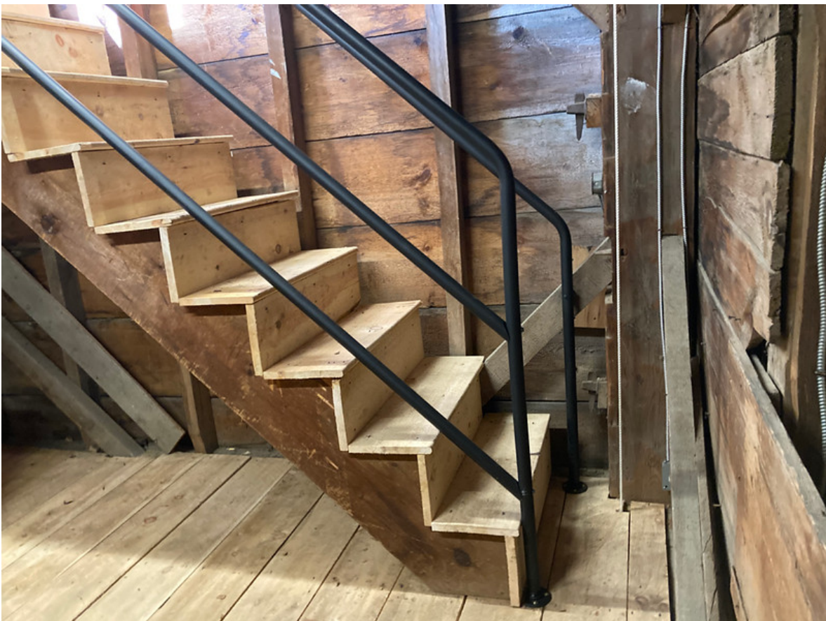
4. Looking north. Stairs up to Level 4. September 24, 2022.