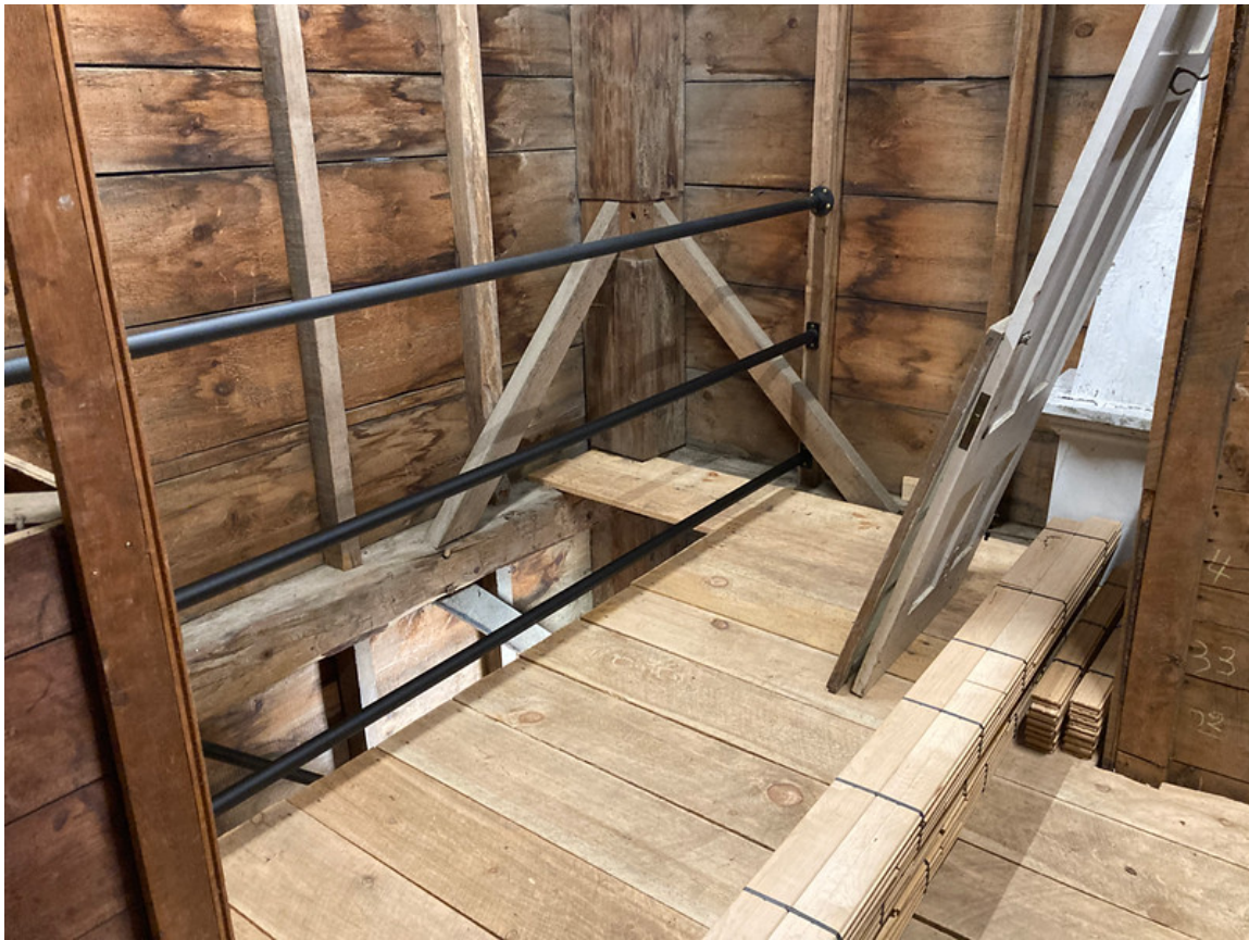
3. Looking southwest. Stairs down to Level 2. September 24, 2022.