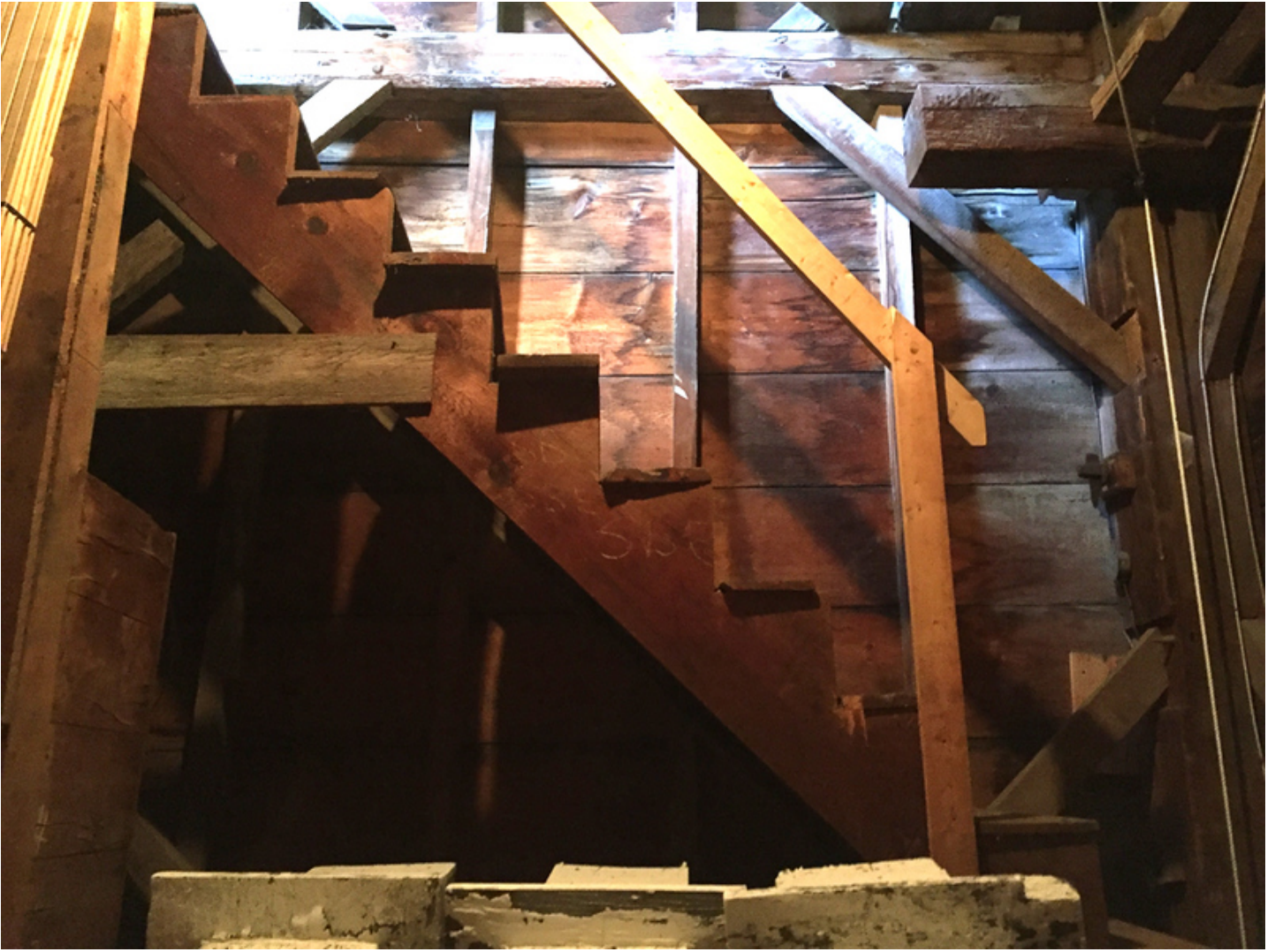
3. Stairs from Tower Level 3 up to Level 4. June 12, 2020.