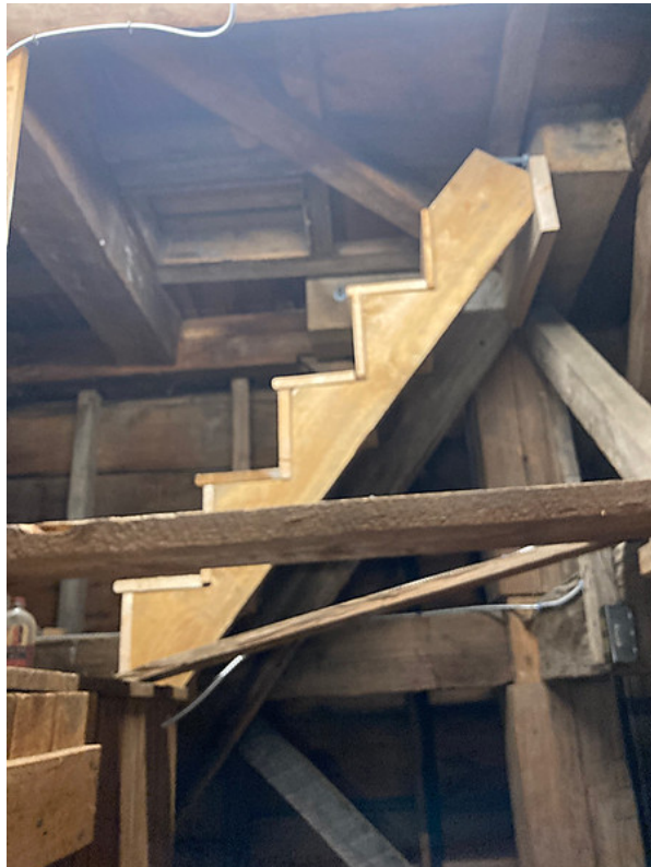
2. Looking south. Stairs to Bell Level 1. September 24, 2022.