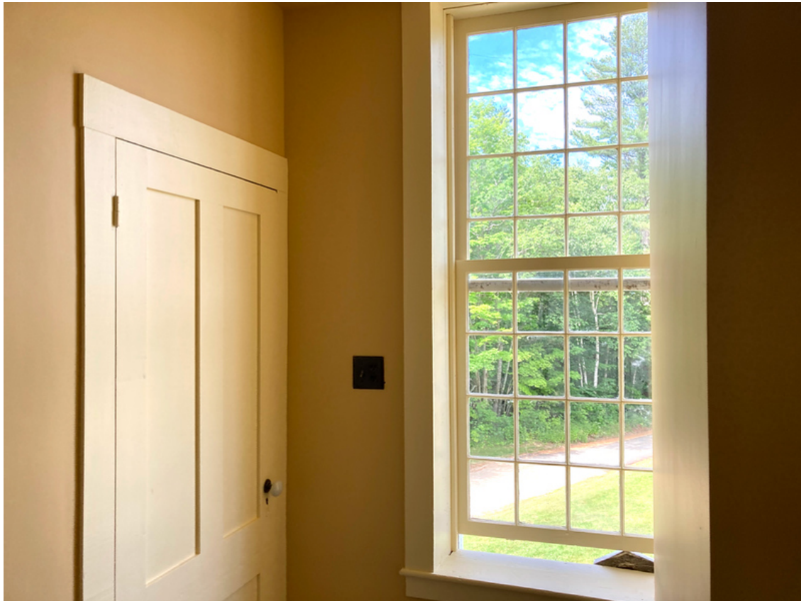
4. Looking west. Door to upper Tower on left. July 4, 2022.