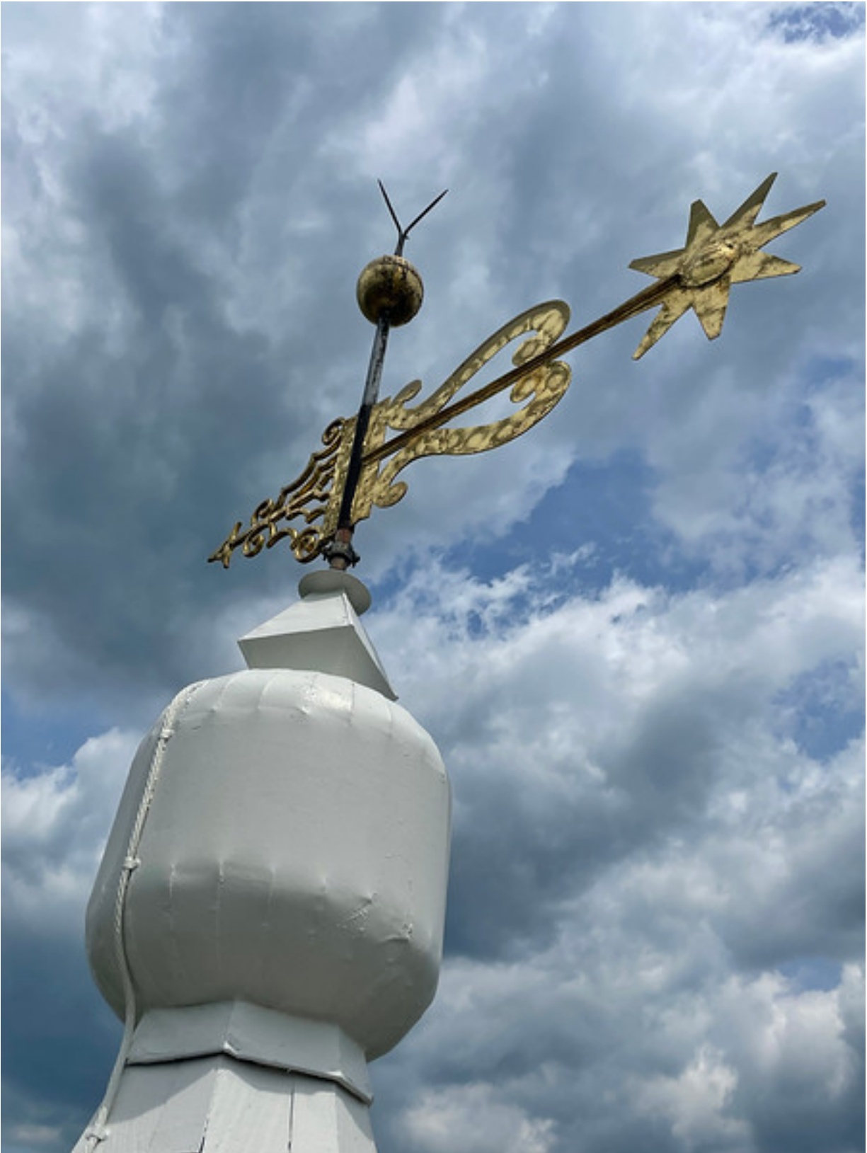
17. Spire and Weathervane. Looking north. June 2, 2022.