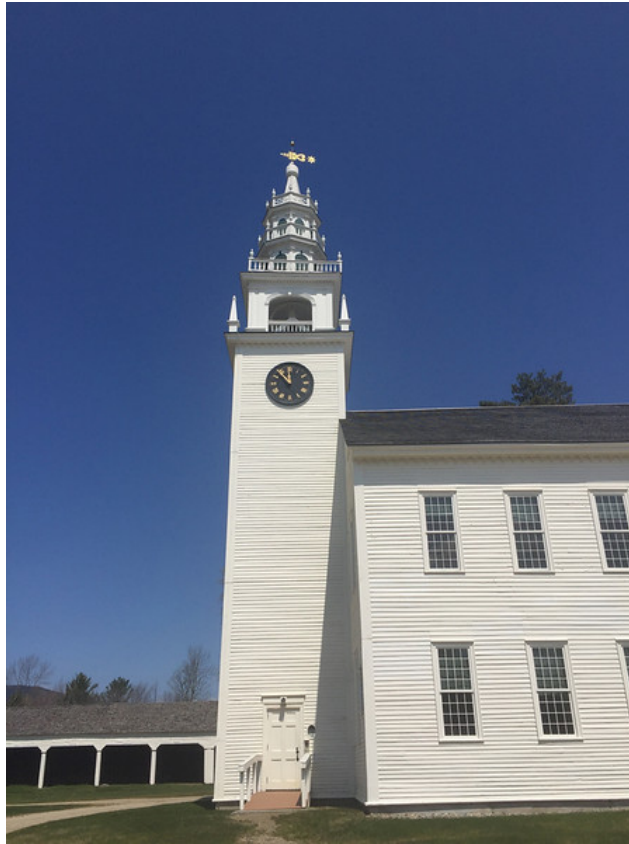
1. View of the Tower looking north prior to any work being done. May 3, 2020.