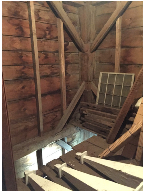
2. Tower Level 3, looking southwest, showing stairs down to Level 2. June 12, 2020.