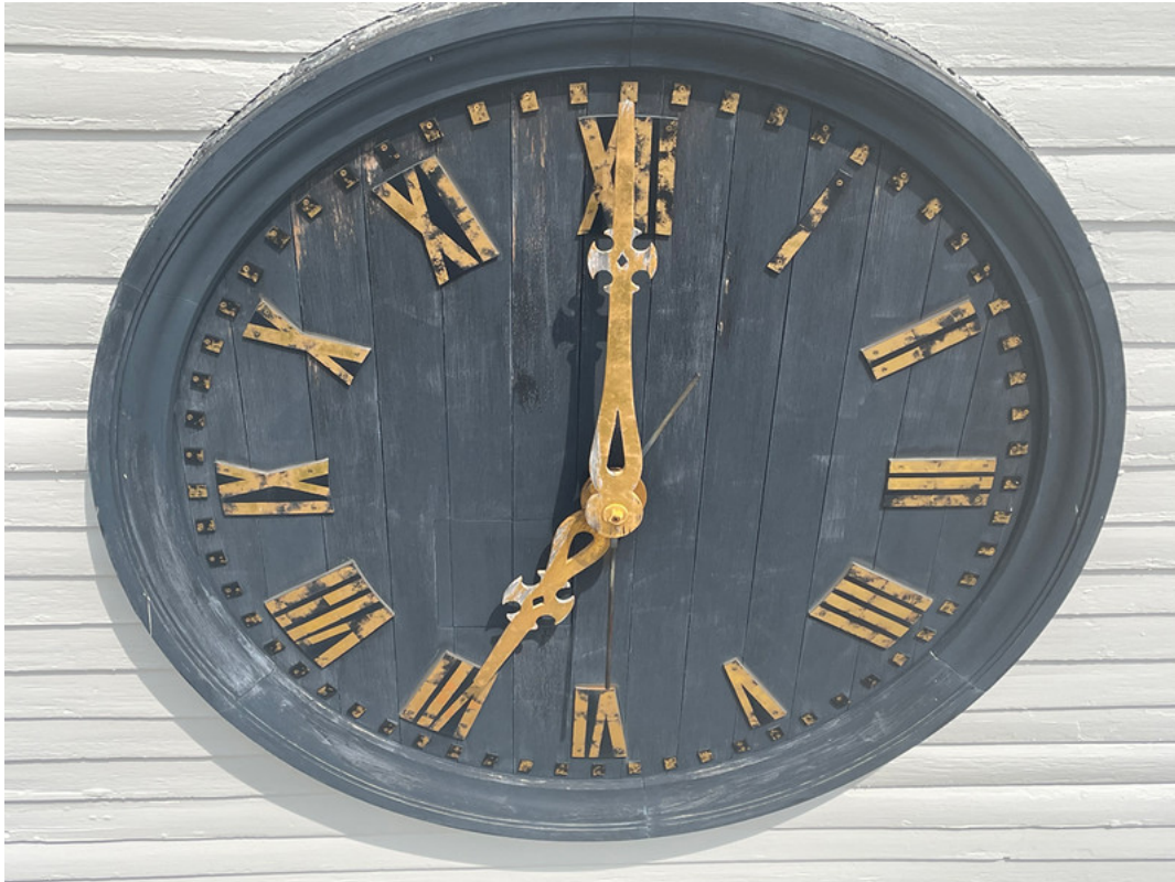
18. Clock Face, probably south, before restoration & regilding. June 2, 2022.