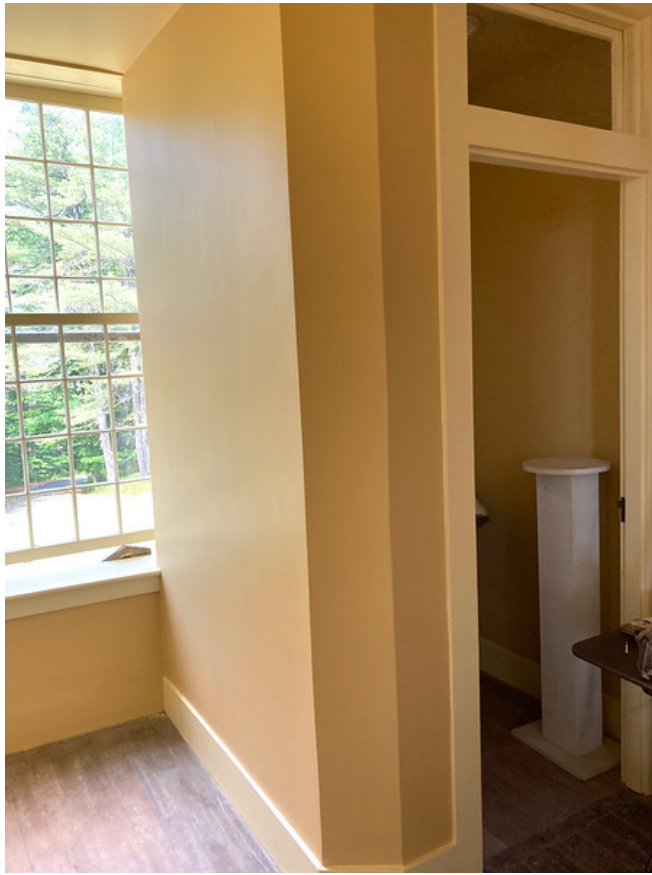
3. Looking northwest. Former toilet cubicle at rear. July 4, 2022.