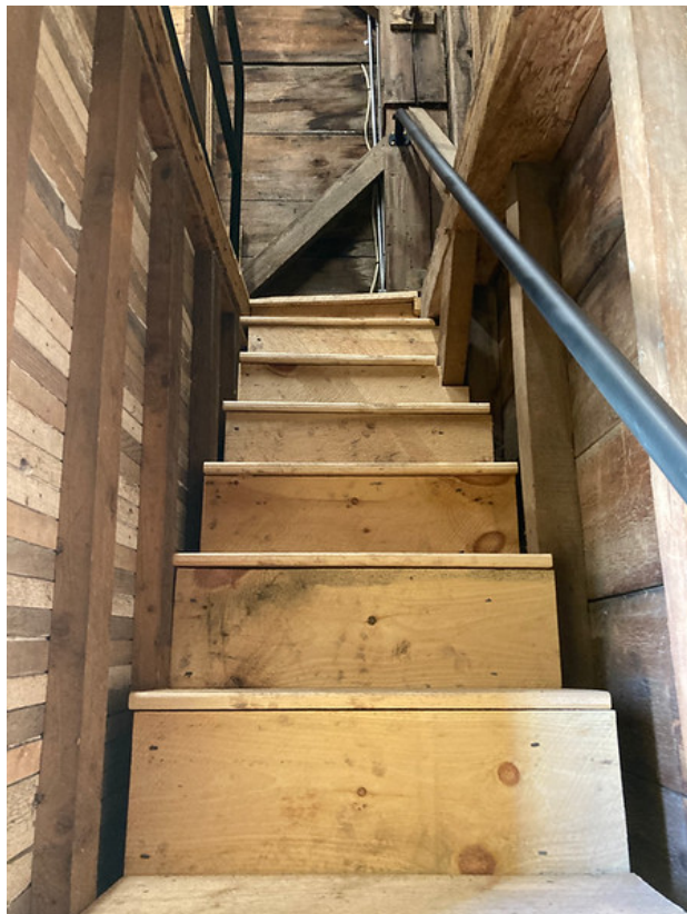
2. Looking east. Stairs up to Level 3. September 24, 2022.